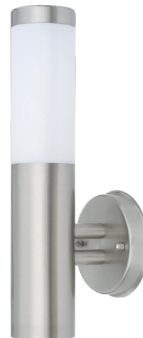
TORRE2 (SS / Wall Light)