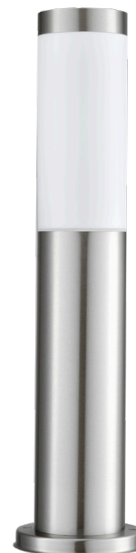
TORRE4 (SS / Bollard Light)