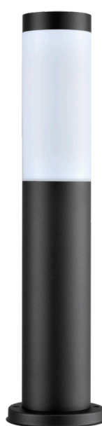
TORRE3 (Black / Bollard Light)

*To avoid disappointment and warranty problems, please ensure the IP Rating of the chosen product is relevant for the intended use.