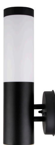
TORRE1 (Black / Wall Light)